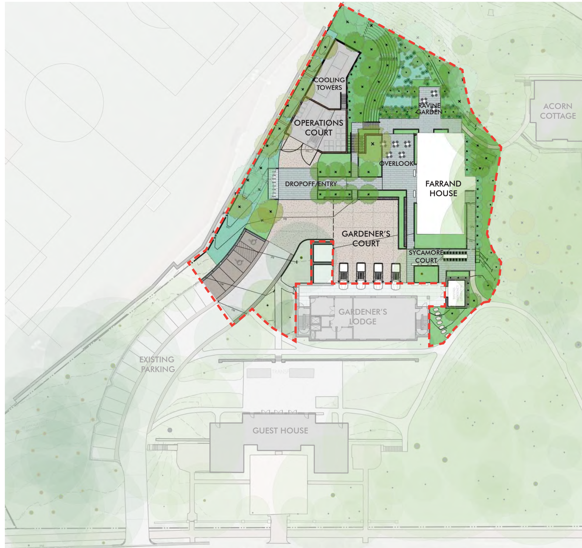
VE SITE PLAN