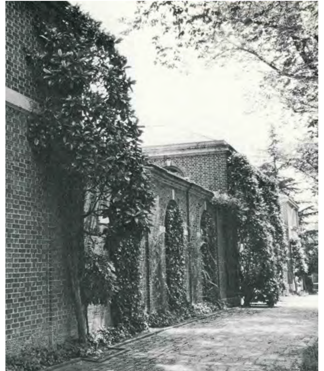
MAGNOLIA GRANDIFLORA GROWING AT 32ND STREET ENTRANCE