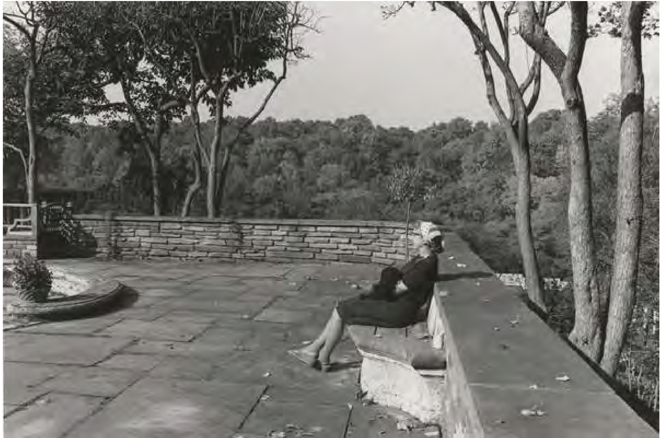
OVERLOOK AT THE ARBOR TERRACE