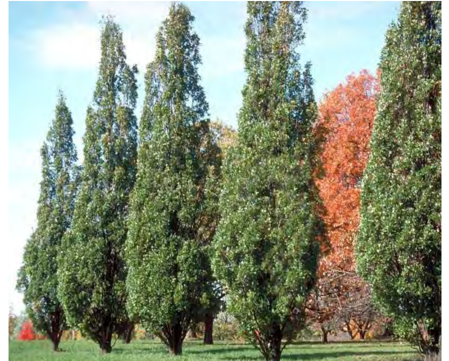
TOP: SWEETGUM BOTTOM: ENGLISH OAK